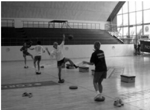
Fig. 1. Handball-specific proprioceptive drills

At the beginning of the season, coaches of the intervention team were educated in the use of the prescribed proprioceptive training program by a physical therapist. The team was provided with wobble boards, soft mats and an instructional DVD. During the season the intervention team was visited three times by a sports physician and a physical therapist to check compliance and ensure proper use of the training program. The training programme was designed in collaboration with sports physicians of the Department of Sports Surgery and Department of Rehabilitation. The main focus of the exercises was to improve awareness and control of knees and ankles during standing, cutting, jumping, and landing. The training program modified from Olsen et al (17) consisted of 24 basic exercises (Box 1) (18, 19). They performed the prevention training twice times a week for 30 minutes, as a special warming up under the supervision of the assistant coach (Fig. 1).